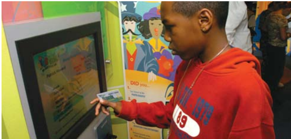
The Money Bus, which provides hands-on financial literacy education for elementary school students, is just one of several initiatives to benefit from a new $3 million gift from the Lilly Endowment, Inc. to Networks Financial Institute at Indiana State University.